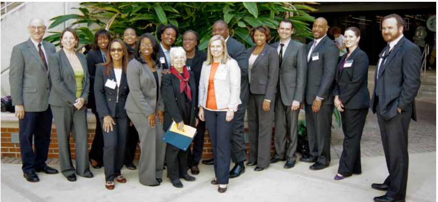
Some of the lawyers who participated in the 4th Annual Law & Justice Youth Conference on Saturday, February 7, 2015.